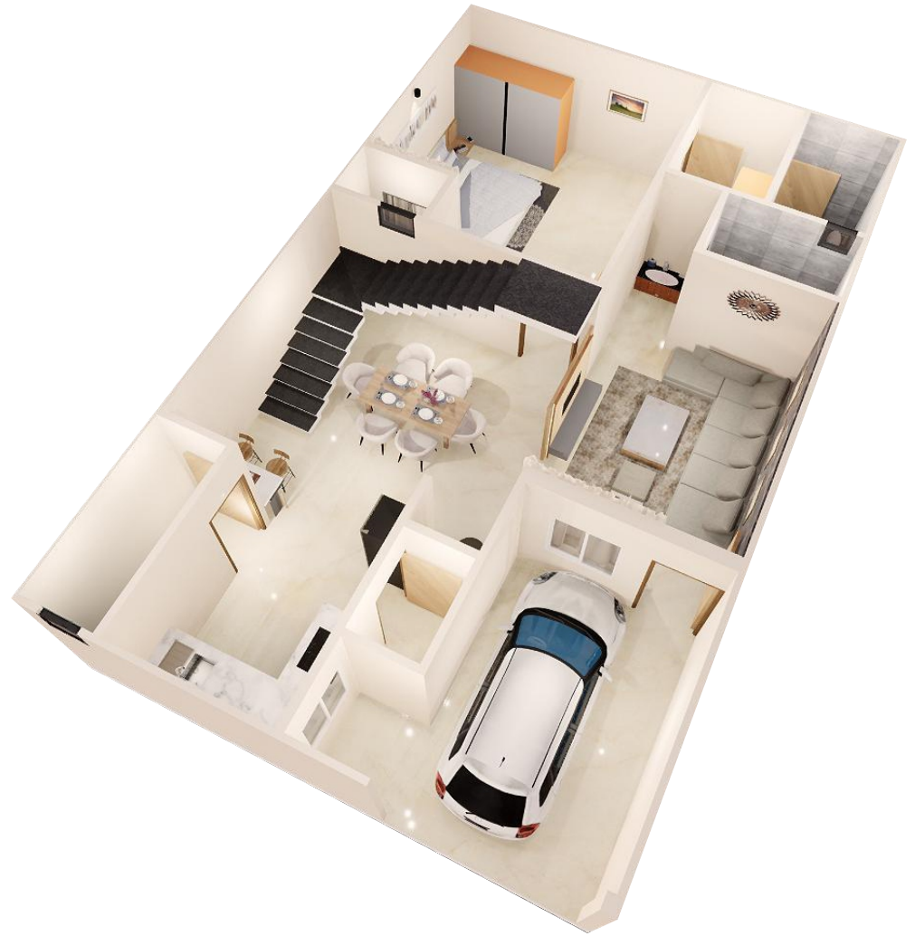
GROUND FLOOR TYPICAL PLAN