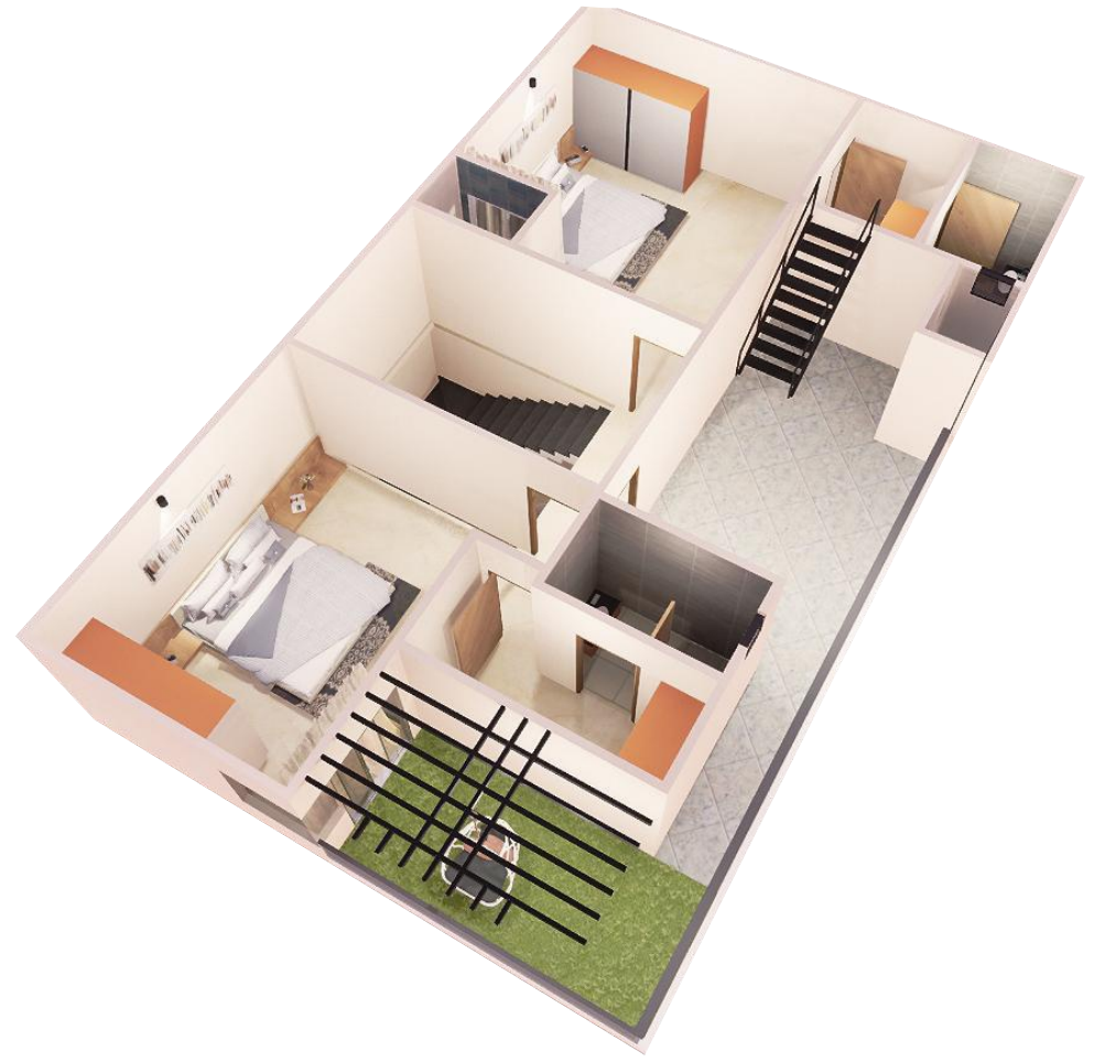
FIRST FLOOR ( 3 BHK ROW HOUSE )